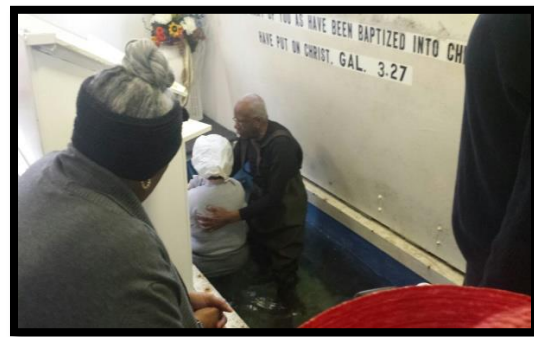
Baptism at Clayton